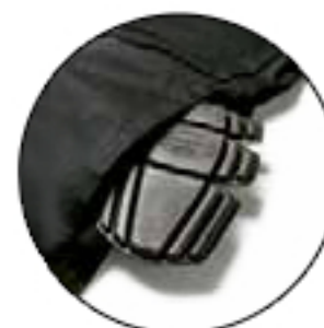
KNEE PAD POCKET