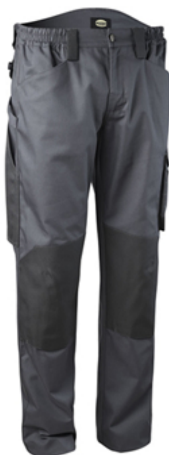
75070 STEEL GREY